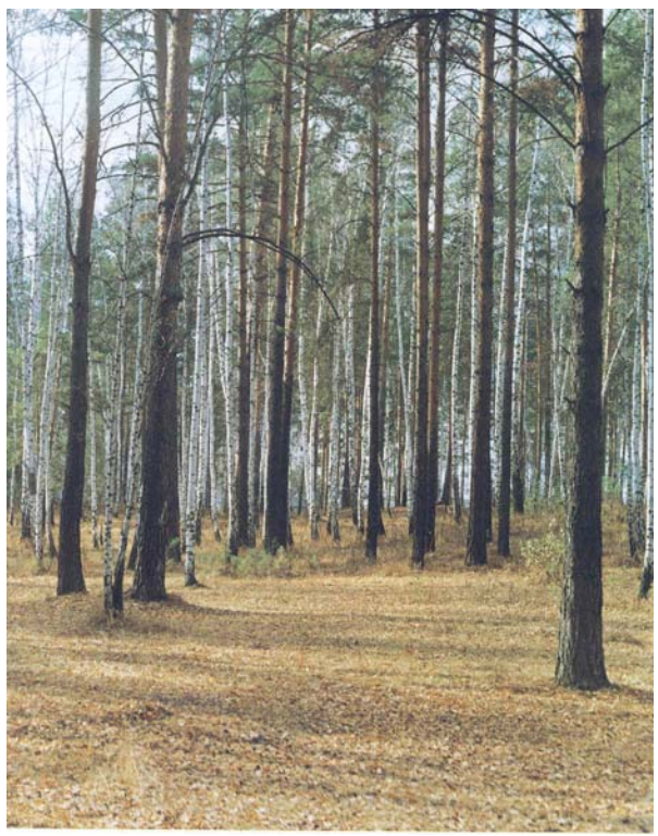
Figure 3 . A birch forest in the EURT (picture from the mid 1990s).